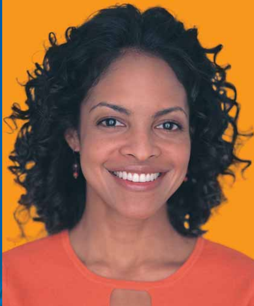
2003 ANNUAL REPORT